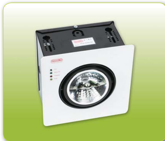
"CRYSTALITE" Cat. CS-6-10-K2-GC false ceiling-mount